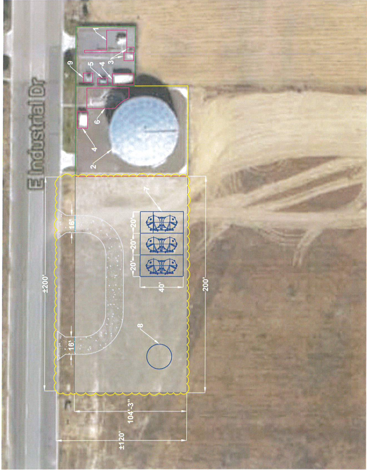
Figure 3 Project No. 2: Well 9A Treatment Site