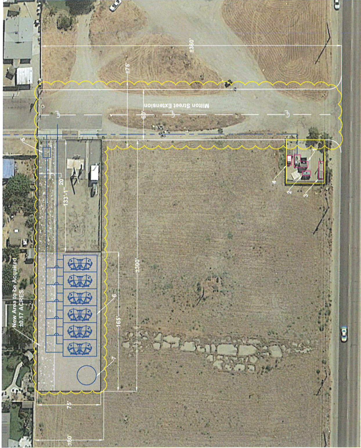
Figure 2 Project No. 1 Well 2A and Well 4A Treatment Site at Existing Lift Station